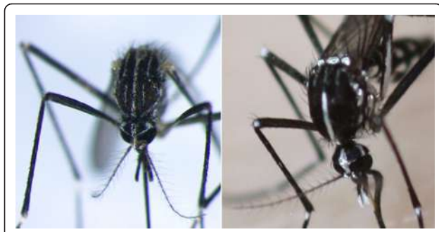
Figure 2 Particular of the mesonotum of Aedes koreicus (left) compared to Ae. albopictus (right).

albopictus , which is mainly based on the use of inexpensive ovitraps. The detection of the typical black Aedes eggs in ovitraps, easy recognizable by non-expert personnel, was sufficient to determine the infestation status of a location with regard to the tiger mosquito. Unfortunately, tiger mosquito eggs are indistinguishable by simple observation under a binocular microscope from the eggs of other Aedes spp., including those of Ae. koreicus . Hence, the species identification at a routine basis in areas where Ae. albopictus and Ae. koreicus may share the same breeding sites, will require to rear the eggs in the laboratory or to include into the surveillance system the more laborious systematic collection of larvae and adults, which require an equipped laboratory and well trained personnel for identification (Figure 2).