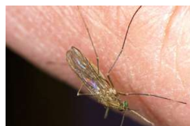
This work was supported by the Public Health and Screening Service, Veneto Region and by the Italian Ministry of Health

Conclusions - Cx.pipiens , the main vector of WNV in north-eastern Italy, is widespread in all the sites monitored. Apart from climatic variables, such as temperature and precipitation, which have been demonstrated so far to modulate the mosquitoes density and their pattern along the year, other variables can be considered as predictor of Cx.pipiens density. In the area monitored, rural and humid areas represent the best habitat, unlike other studies in USA that identified urban and peri-urban sites as the most suitable sites for this species. The data also suggest that horses may be more attractive for Cx.pipiens compared to cattle and pets, offering new hints for experimental studies. Although Cx.pipiens is normally considered ornithophilic, an association with wild or domestic birds presence was not found, however no data on density and species composition were available. Finally, the absence of evident effects of disinfestations on mosquito density stresses the importance of using standard methods to determine the efficacy of disinfestations.